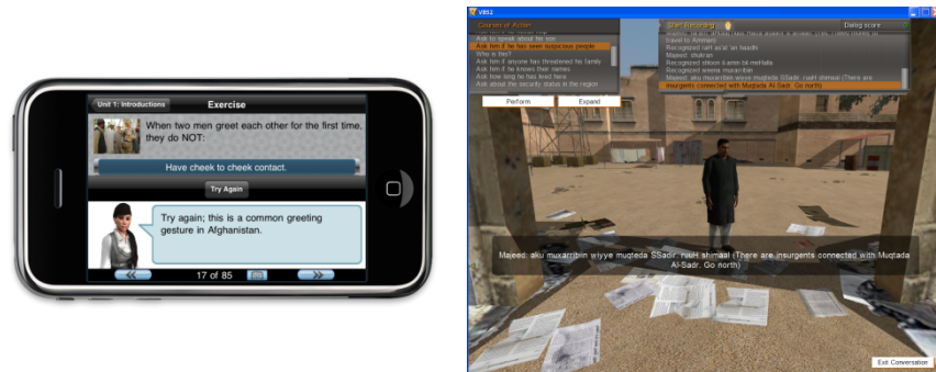
FIGURE 2. OLCTS handheld and multiplayer training platforms.